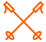
XC Ski / Snowshoe